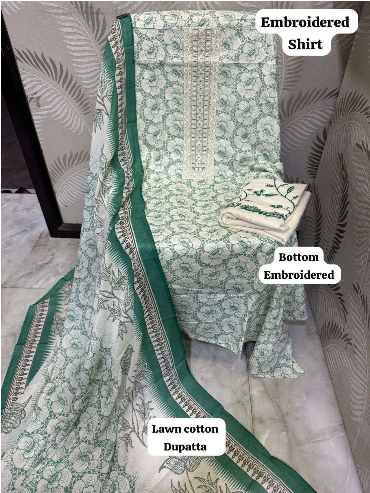
Lawn cotton Dupatta