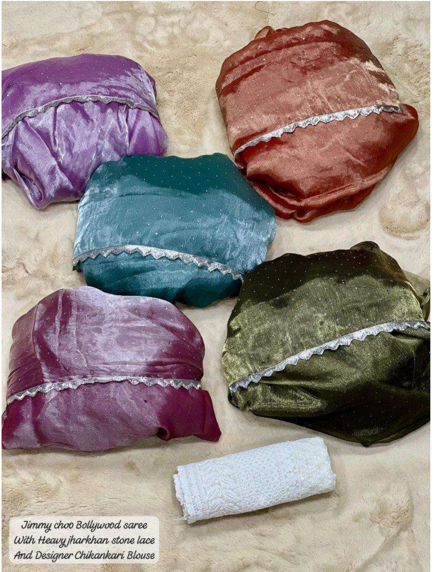
Jimmy chod Bollywood saree With Heavy jharkhan stone lace And Designer Chikankari Blouse