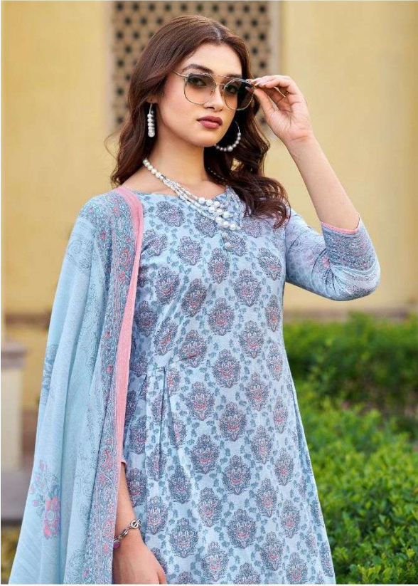
Just as wine ages with care, dresses need meticulous crafting and premium fabrics to express their excellence.

Owning Your Components, Be Your Own Muse