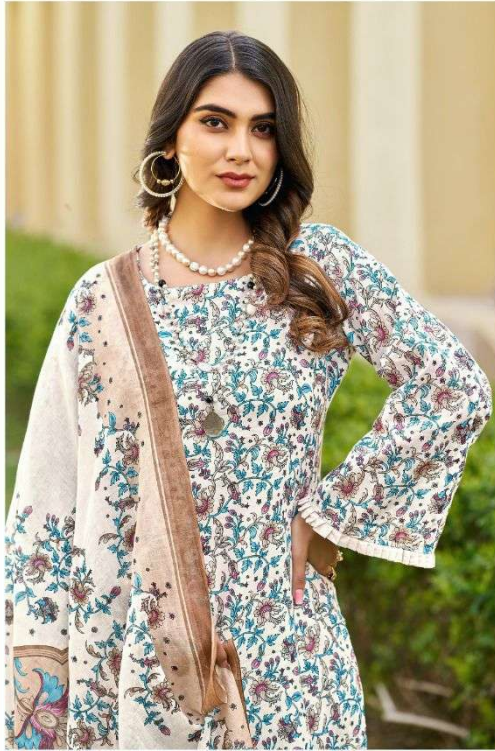
Dresses, resembling wine, require expert craftsmanship and the use of the finest fabrics to reveal their quality.