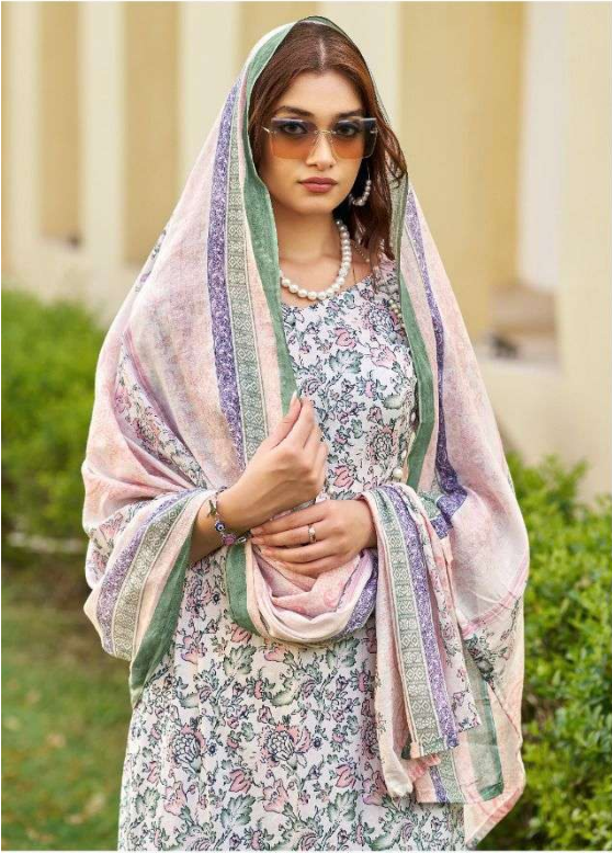
"Where Confidence Meets Glamour, You're Always Gorgeous."