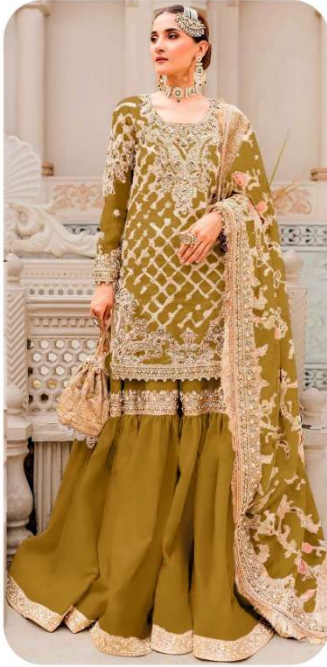
D.No 241 A