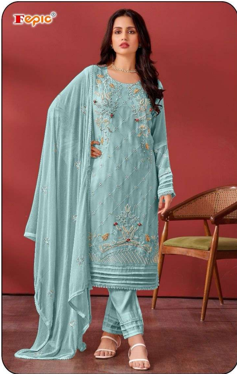
C - 1665 I