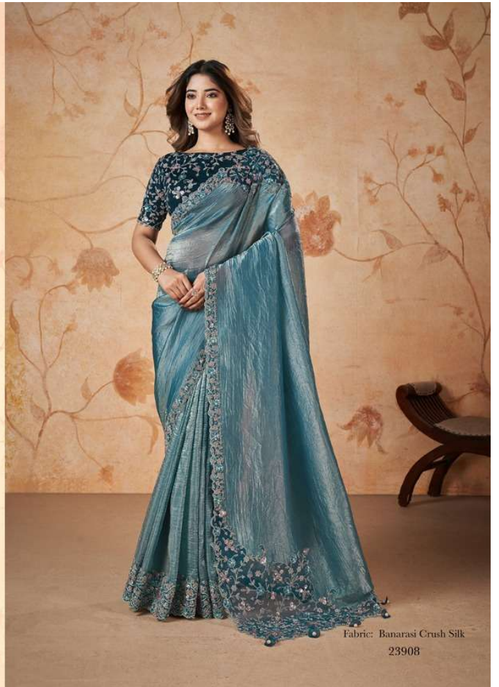
Fabric: Banarasi Crush Silk 23908