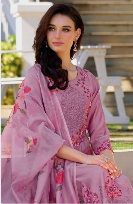
D.NO 16109 | I told myself repeatedly, "One day you will be famous"