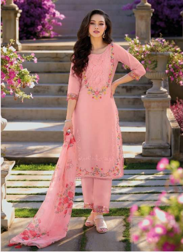
LNO 16106 Elegance is not standing out, but being remembered