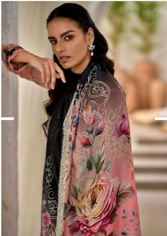
OUTFITS THAT WILL MAKE YOU COMFORTABLY BEAUTIFUL