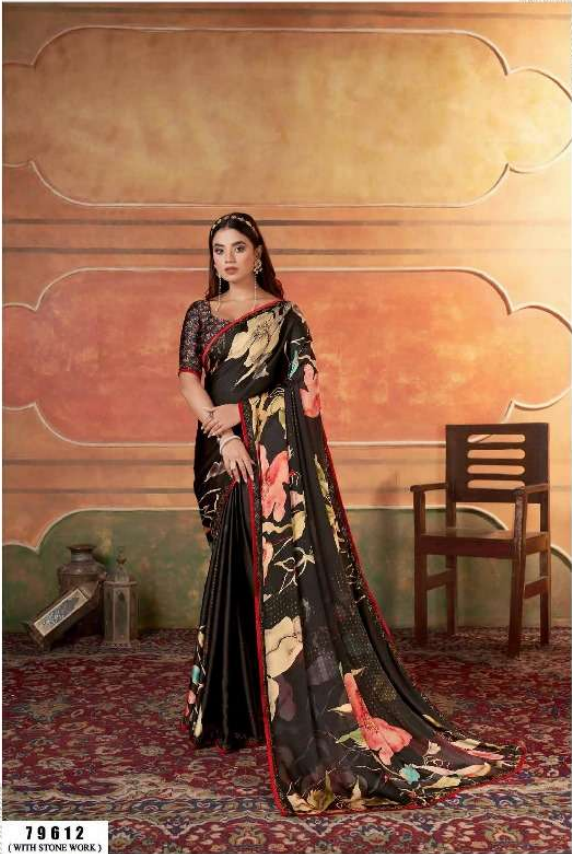
79612 (WITH STONE WORK)