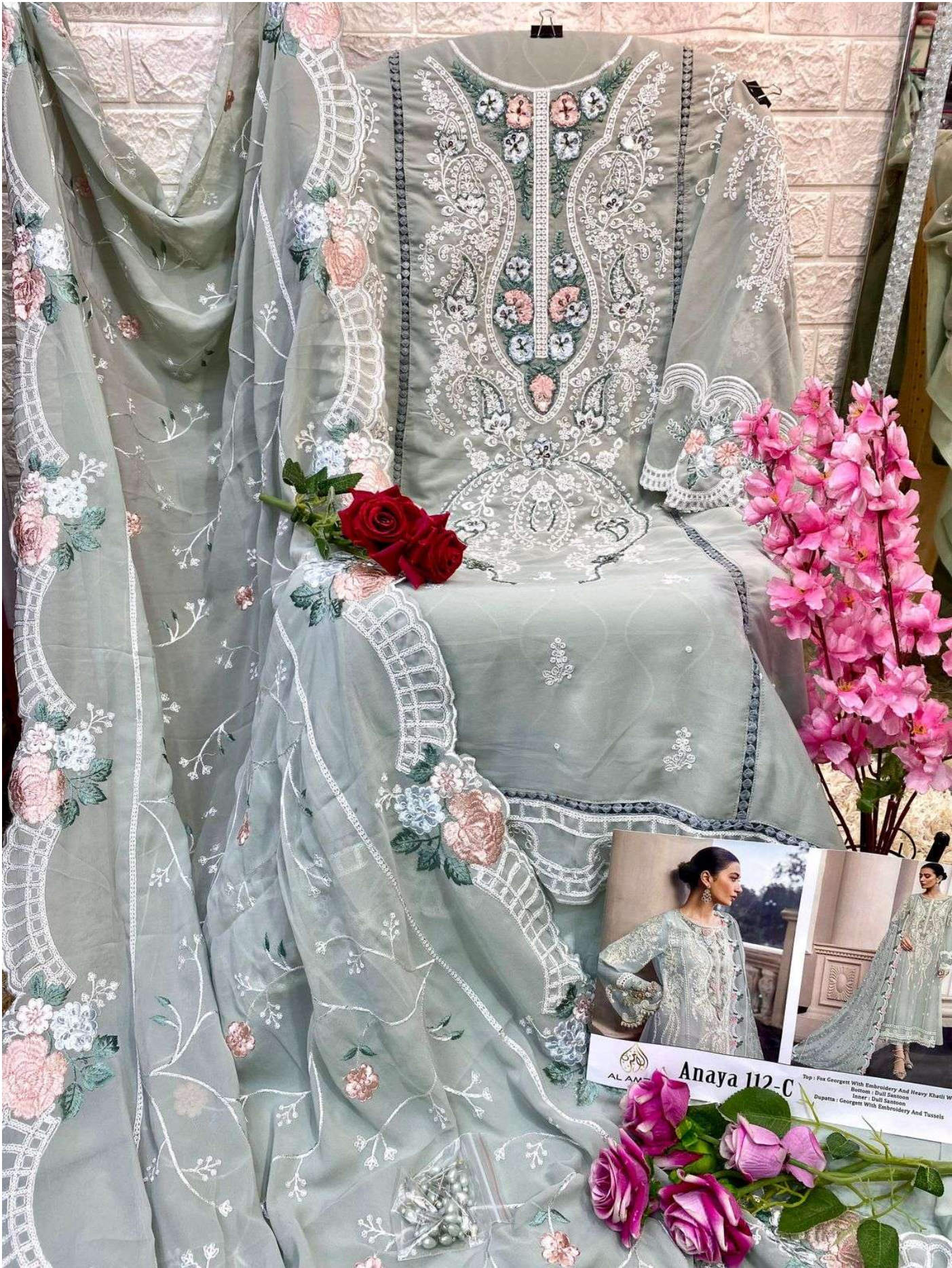
AL AMAN Anaya 112-C Top : Fox Georgett With Embroidery And Heavy Khattl W Bottom : Dull Sattoon Inner : Dull Sattoon Dupatta : Georgett With Embroidery And Tussels