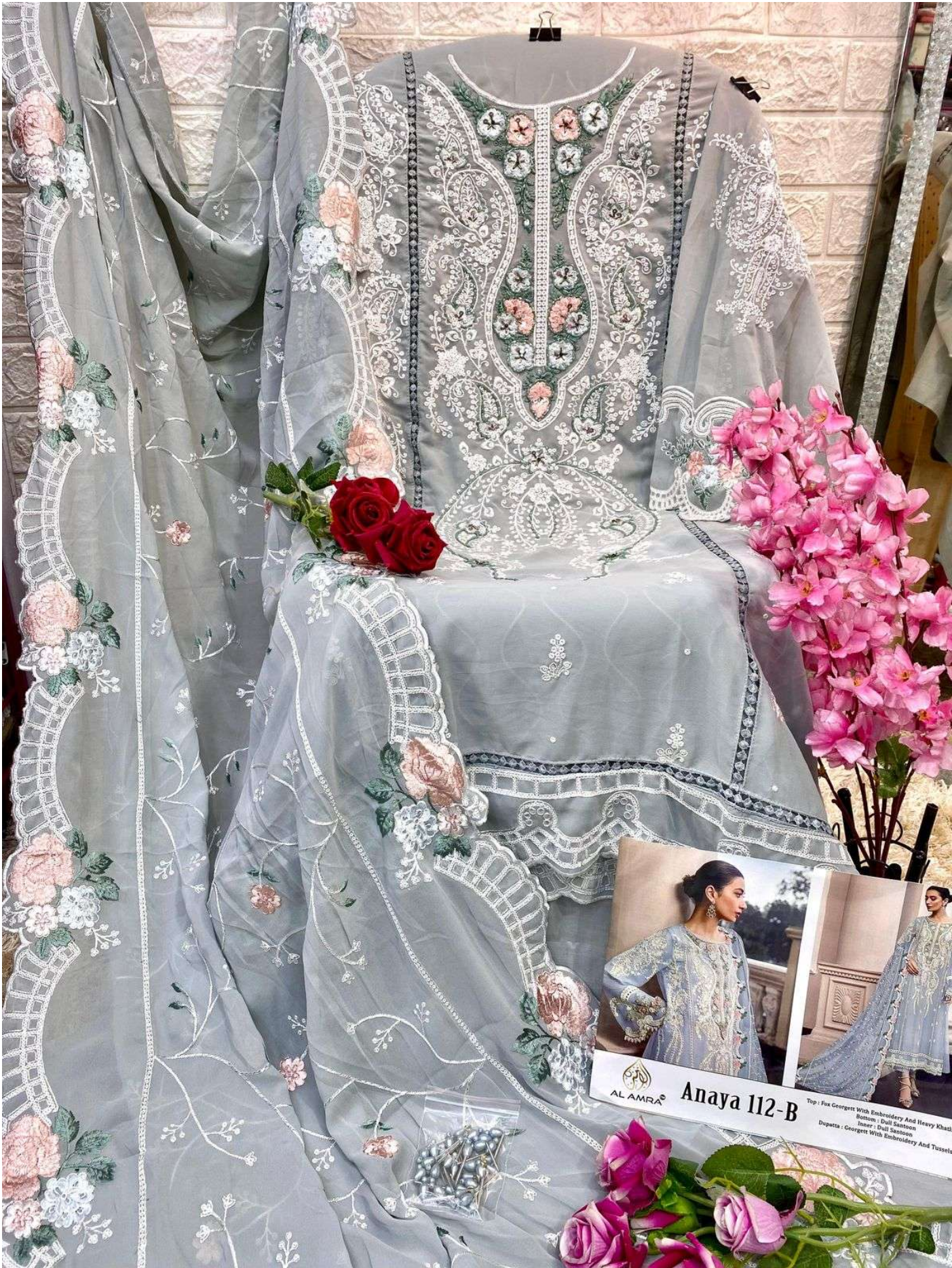
AL AMRA Anaya 112-B Top : Fox Georget With Embroidery And Heavy Khadi Bottom : Dual Santoon Inner : Dual Santoon Dupatta : Georget With Embroidery And Tussets