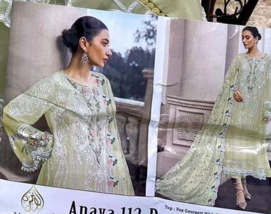
ALAMRA Anaya 112-D Top : Fox Georgett With Embroidery And Heavy Kh Bottom : Dull Santoon Inner : Dull Santoon Dupatta : Georgett With Embroidery And Tulle