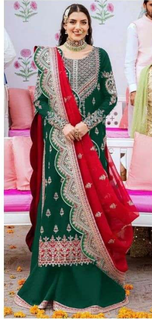
7773 D.No:-286 C