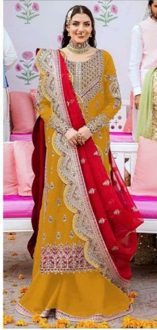
7773 D.No:-286 B