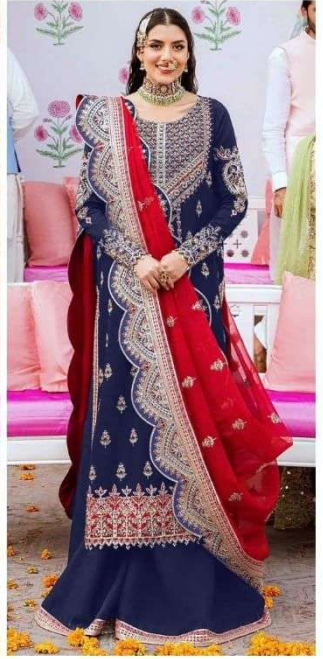
7773 D.No:-286 D