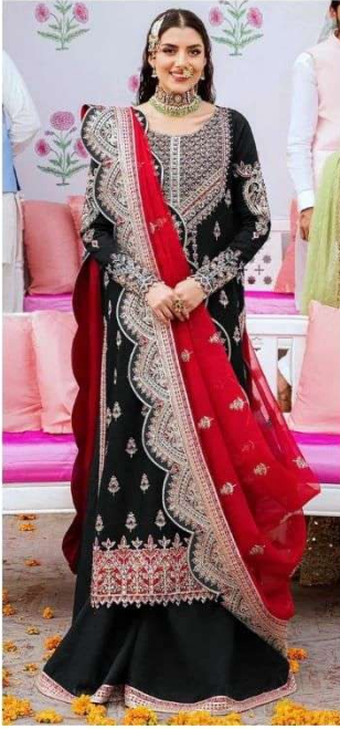
7773 D.No:-286 A

TOP- PURE FOX GEORGETTE WITH HEAVY EMBROIDERY AND SEQUENCE WORK BOTTOM/INNER- DULL SHANTOON DUPATTA- PURE FOX GEORGETTE FANCY DUPATTA AND HEAVY EMBROIDERY